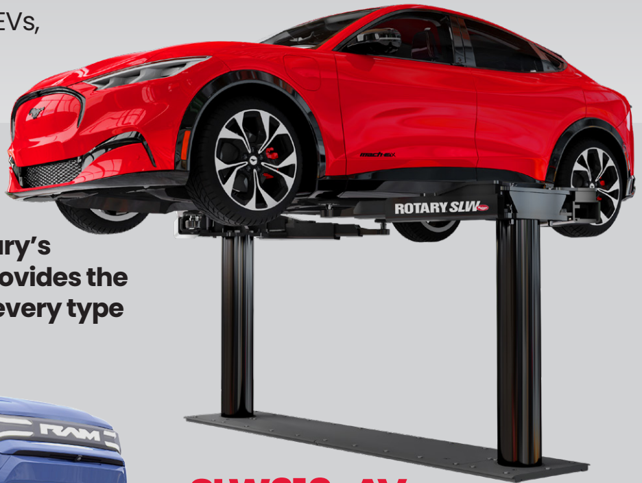
SLW210-AV 10,000 LBS. CAPACITY LIFTS