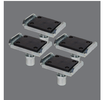
TA Truck Adapters

Round, padded RA polymer adapters thread-up for additional positioning.