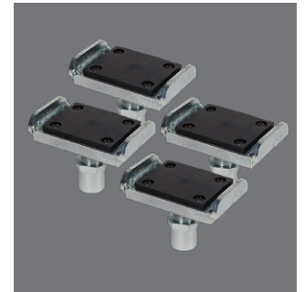
TA Truck Adapters

Round, padded RA polymer adapters thread-up for additional positioning.