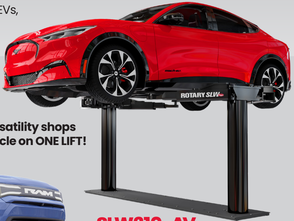
SLW210-AV 10,000 LBS. CAPACITY LIFTS