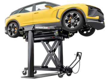
SHOWN: SL210W-AV with LT35 lift table and RT30 repair table