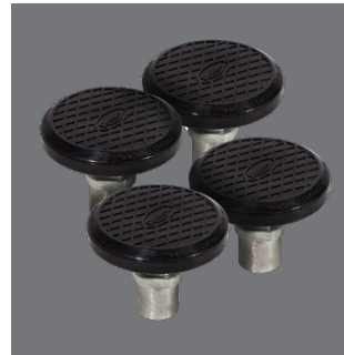
RA Round Adapters

Simplify your shop and give techs the flexibility and clearance needed to service any vehicle.