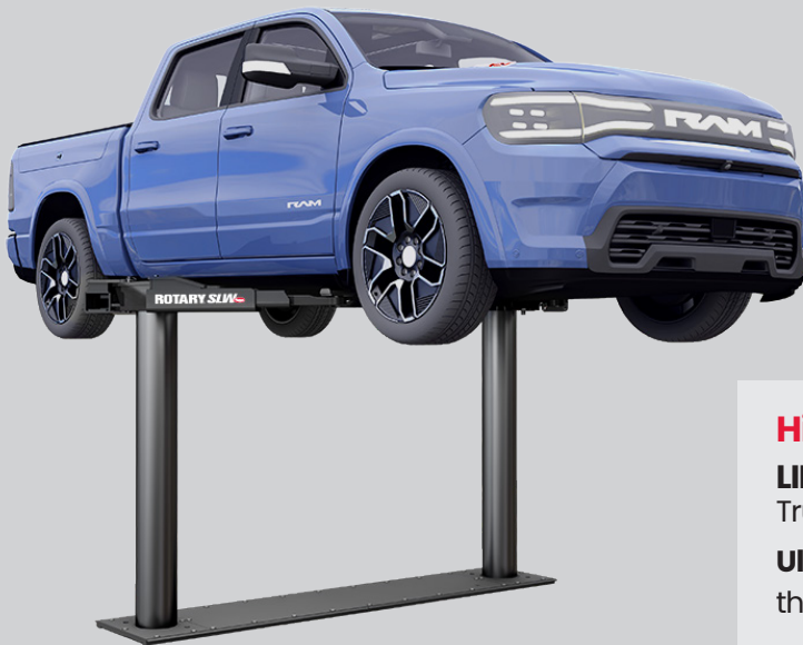
SLW212-AV 12,000 LBS. CAPACITY LIFTS

The WIDE SMARTLIFT with Rotary's patent-pending AVARMS™ provides the versatility shops needs to lift every type of vehicle on ONE LIFT!