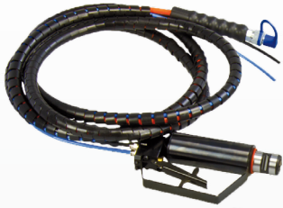
Hydraulic Gun HP 35 UN