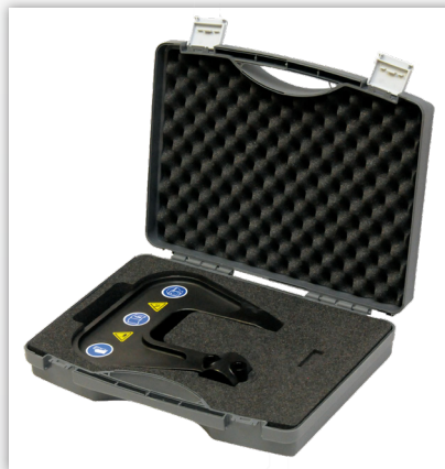
Rivet Clamp NB 115 #CHR2204