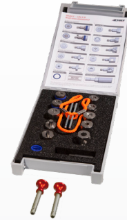
Riveting Tool Kit Locking Bolts