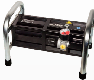
Pressure Intensifier PNP90