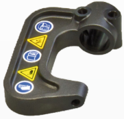
Rivet Clamp NB 40