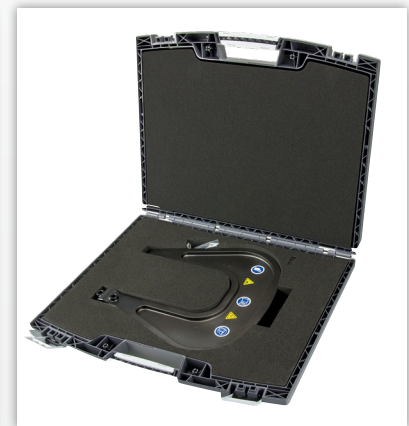
Rivet Clamp NB 230 #CHR2203