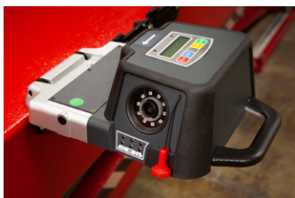
Rubber armored, high resolution measuring heads