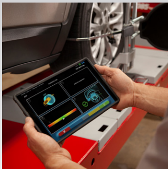
Control remotely with integrated Android Tablet

PERFORM ALIGNMENTS 30% FASTER! MONITOR AND CONTROL THE PROCESS RIGHT FROM YOUR HANDS – NOT THE CONSOLE FEWER STEPS = QUICKER ALIGNMENTS