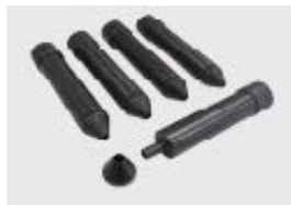
VSG1000A102 5 stud kit 110mm long for reverse rims. Used with VSG1000A158