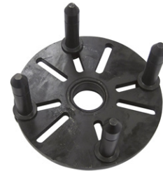
VSG1000A123 Plastic/Chrome Clad adapter for clamping wheels through locking holes