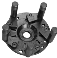
VSG1000A158 Universal flange for reverse, and Chrome Clad wheels