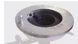
VSG1000A152 Light truck adapter for centering locking tire changer - 19.5" wheels