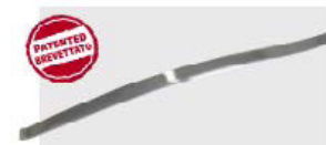
VSG1000A11 Bead tire lever