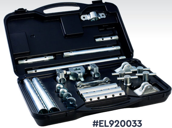
#EL920033 ACCESSORY KIT INCLUDED WITH PURCHASE