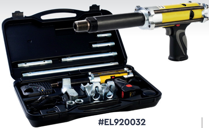
#EL920032 STANDARD KIT