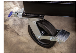
Locks shown in the raised position during lowering of table

Compliant with Standards for Garage Equipment - adds additional support and safety guidelines