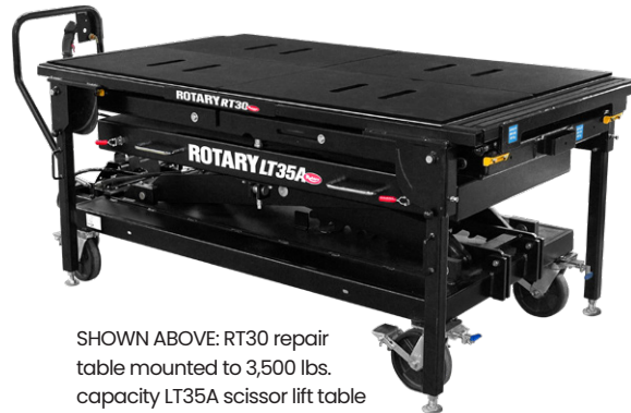
SHOWN ABOVE: RT30 repair table mounted to 3,500 lbs. capacity LT35A scissor lift table

Use numerous RT30 repair tables with a single LT35A lift table and reduce the need for multiple lift tables!