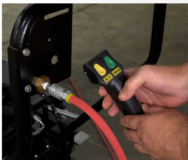
SHOP AIR OPERATED HANDHELD PENDANT CONTROLS

WATCH & LEARN! Scan code to watch product videos.