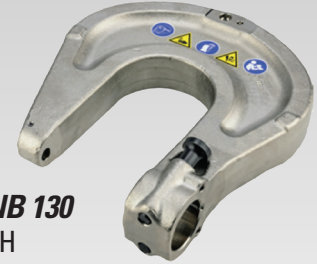
Rivet Clamp NB 130 #CHR2430H