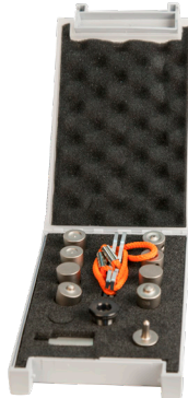
Kit 2 - Flow form rivets Forming, SPR-Extraction Ø6mm + Ø8mm #CHR2416H