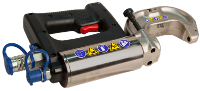
Hydraulic Gun DN4-XT 2 #CHR2411H