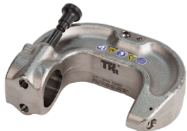
Rivet Clamp NB 45 #CHR2412H