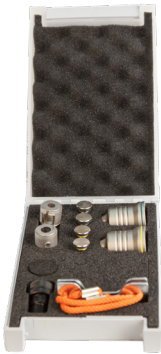
Kit 1 - Punching Ø6mm + Ø8mm #CHR2415H