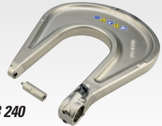
Rivet Clamp NB 240 #CHR2431H