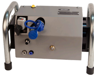
Pressure Intensifier PNP90 SNW XT 2 #CHR2410H