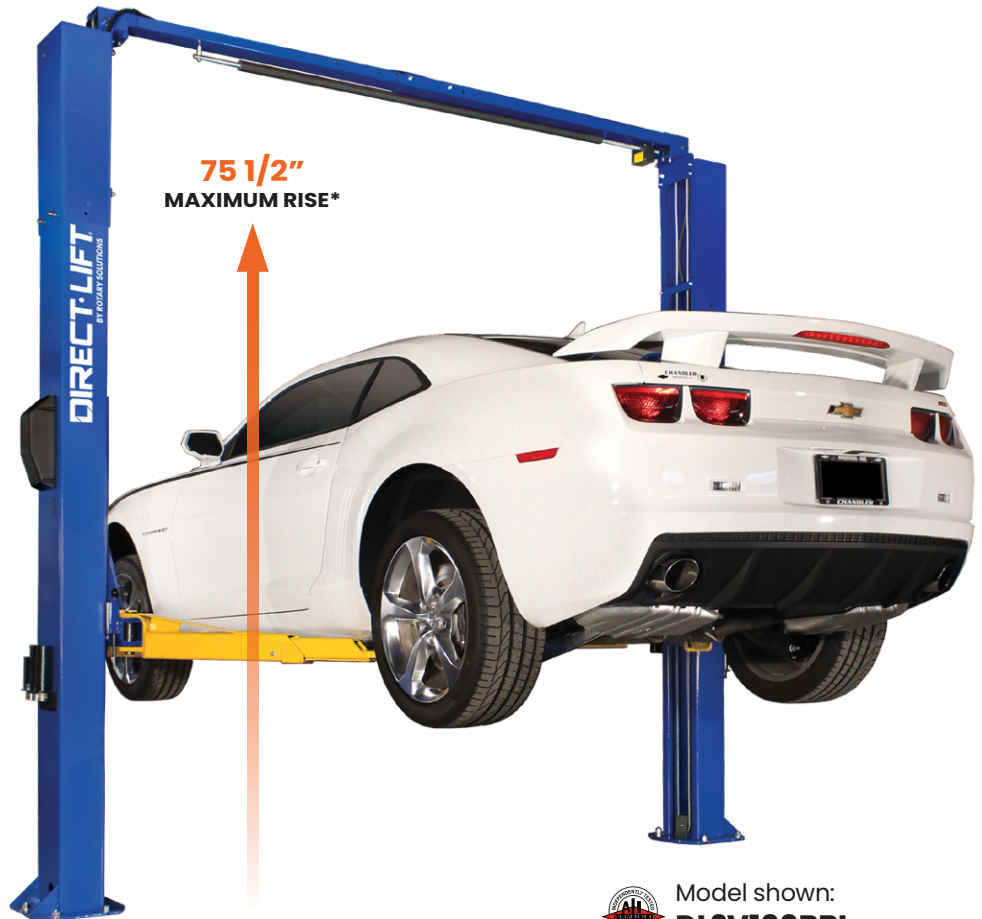
Model shown: DL9V100BBL