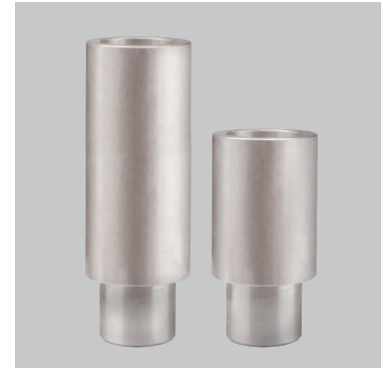
FOUR (4) EACH 2 1/2" ADAPTER EXTENSIONS