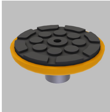
PADDED THREAD-UP ADAPTERS