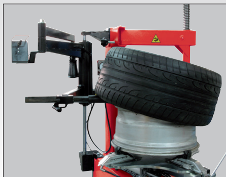
SHOWN: Helper arm demounting lower bead