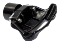
PLASTIC TOOL HEAD VSG800A60 Tool head with support

ROTARY WHEEL SERVICE EQUIPMENT carries a 3 year warranty. See website for details.