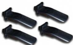
VSG800A6KIT Clamp Protectors / 24" - 26" (4 pcs)