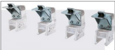
SMALL WHEEL ADAPTER VSG800A111KIT Reduces clamping capacity to 8" for ATVs and lawn equipment tires. - requires VSG800A107 wheel clamps